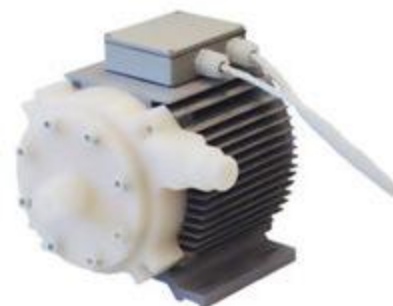
Figure 11: Levitronix® Pump System BPS-4

Max. Differential Pressure: 4.5 bar 65 psi Max. Flow: 120 l/min 32 gal/min Max. Liquid Temperature: 85 °C 185 °F Wet Materials: PTFE, PFA, PVDF, ECTFE Supply Voltage: 230 V (AC, single phase) and 115 V (AC, 3-phase)