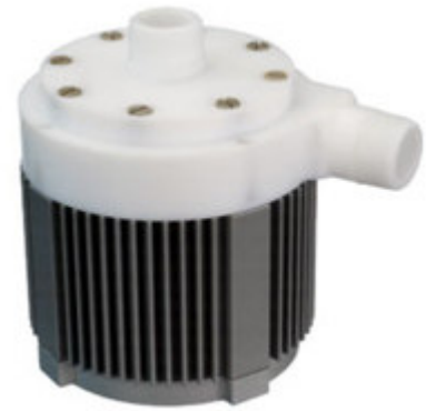
Figure 7: Levitronix® Pump System BPS-3

Max. Differential Pressure: 3.5 bar 50 psi Max. Flow: 50 l/min 13 gal/min Max. Liquid Temperature: 85 °C 185 °F Wet Materials: PTFE, PFA, PVDF, ECTFE Supply Voltage: 72 V and 48 V (DC)