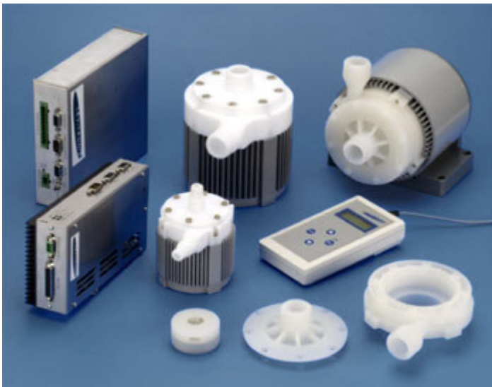
Bearingless pump systems for DC voltage supply BPS-1 and BPS-3